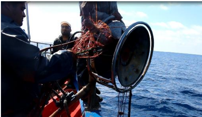
Hauling lobster trammel net at Esquerquis Bank (May 2015)

I have been working as a fisherman for more than 30 years, including 25 years targeting Spiny lobster . In Bizerte, there are around 20 fishing boats that specialize in lobster fishing. We start the professional fishing in area of La Galite island. Later, some of the fishermen head to Esquerquis Bank area, while I stay more around La Galite, as its small port provides shelter in bad weather conditions. I use trammel nets called mbatten in Tunisia, with a mesh size of 80cm.