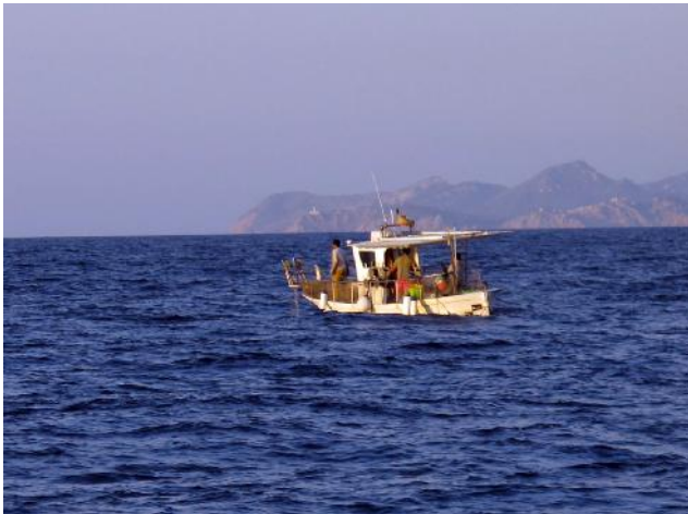
Artisanal boat 8m long fishing in the middle of the Minorca Channel.